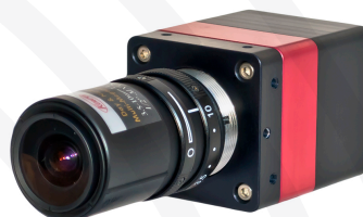
Model and lens used for illustration purposes only