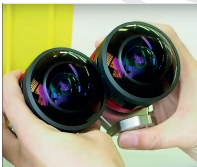
3.6mm lens shown