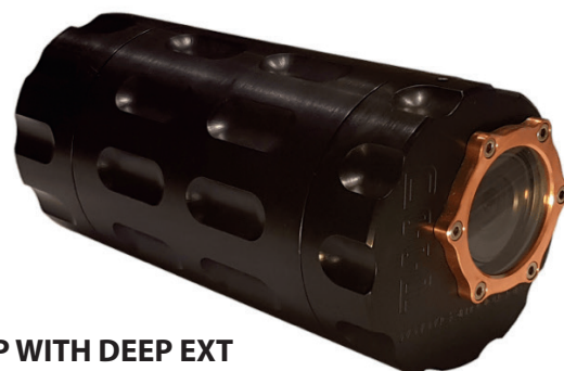
DEEP WITH DEEP EXT